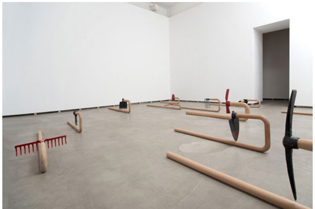
Blue Collar White Collar 2013-4 - Pascal Hachem

My reflection involves displacing actions. They are real actions, not videos, performed either by me or by objects that I set up. I don't impose any set of rules upon myself, but rather am prompted by nothing but a single impressionable moment, to declare!"