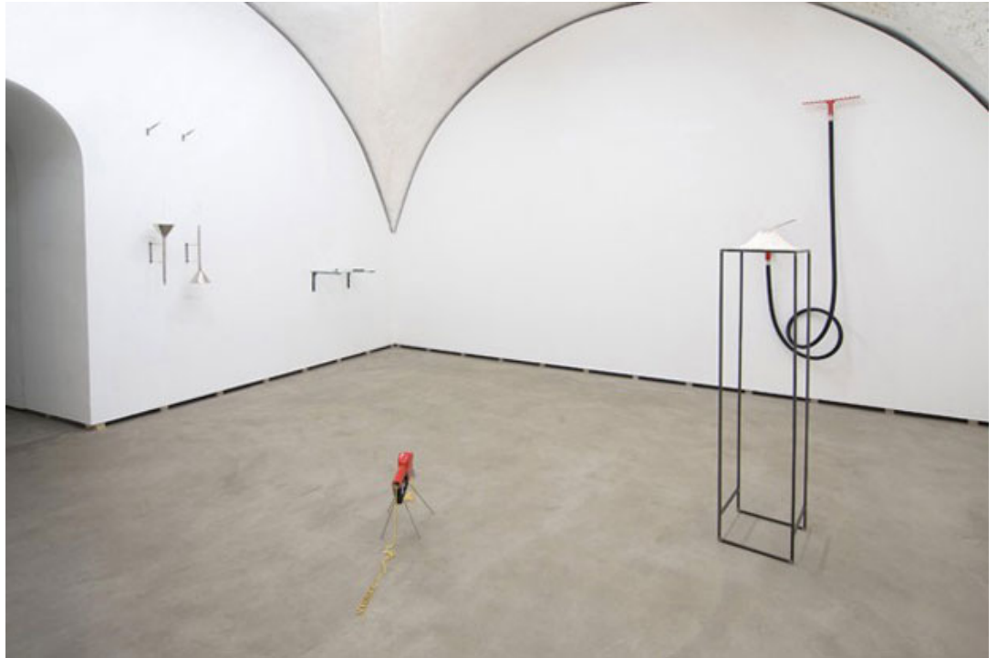
You Always Want What The Other Has - Pascal Hachem 2013

My reflection involves displacing actions. They are real actions, not videos, performed either by me or by objects that I set up. I don't impose any set of rules upon myself, but rather am prompted by nothing but a single impressionable moment, to declare!"